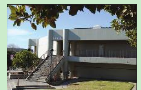
The Acasia and Roble Buildings at Evergreen Valley College are slated for demolition.