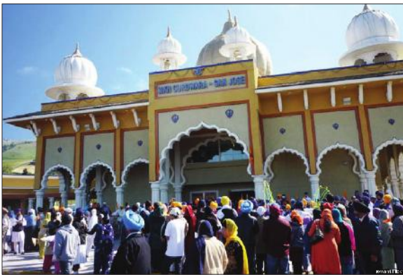
It is estimated more than 15,000 people visited the Gurdwara (pronounced gur-d-wara) from 9 a.m. to 9 p.m. to hear the first prayer of 2017.